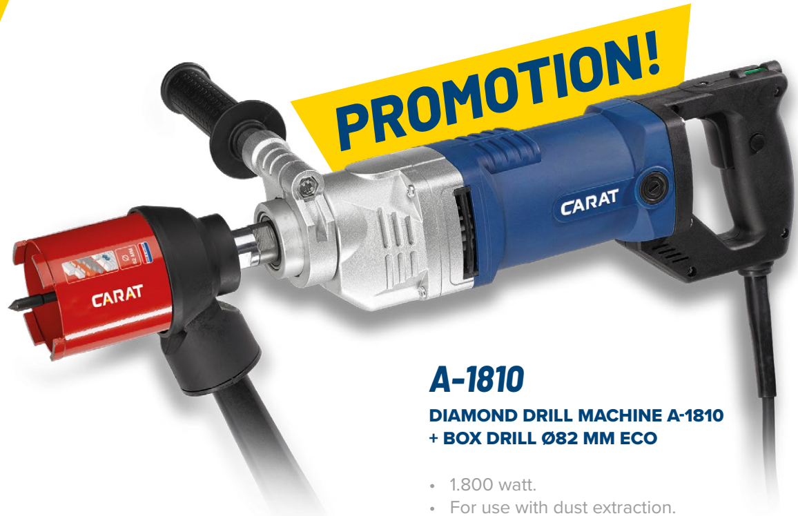
A-1810 DIAMOND DRILL MACHINE A-1810 + BOX DRILL Ø82 MM ECO